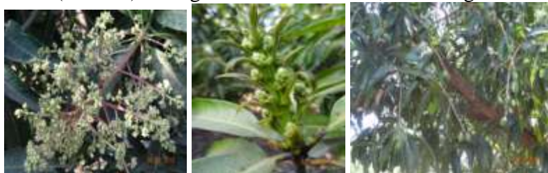
(Department of Horticulture, CoA, JAU, Junagadh)

It is recommended to scientific community that the climatic parameters like temperature, humidity, rainfall, bright sun shine hours and wind velocity influenced the flowering, fruit setting, fruit dropping, number of fruit per plant and fruit yield. Higher day temperature with lower night temperature as well as more fluctuation in day & night temperature disturb the flowering, pollination and fruit setting process. Similarly, higher humidity, dew, late rain or off seasonal rain during flowering also affects adversely. Mango requires 25-30 °C day temperature & 15-18 °C night temperature, 40-45% humidity, no dew formation, lower late rain (September), higher sun shine hours (8-9 hrs.) during floral bud initiation, flowering and fruit setting.