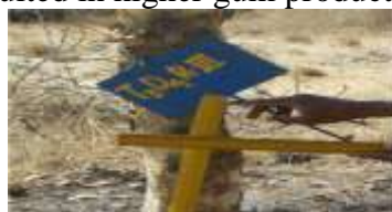
(Grassland Research Station, JAU, Dhari)

It is recommended that application of 5 ml ethephon @ 100 ppm [0.25 ml Ethrel (40%) in 1 liter of water] to Acacia senegal (Gorad) above one meter ground level having 51-70 cm trunk girth during first fortnight of March resulted in higher gum production and higher net return.