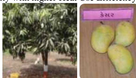
(Department of Horticulture, CoA, JAU, Junagadh)

It is observed that the growing degree days (GDD) have direct influence on BDS, flowering, fruit set and various fruit development stages, but not for the physical characters of fruits. The GDD requirements of different varieties were found unique and a mango variety Kesar requires low GDD for maturity with higher Heat Use Efficiency.